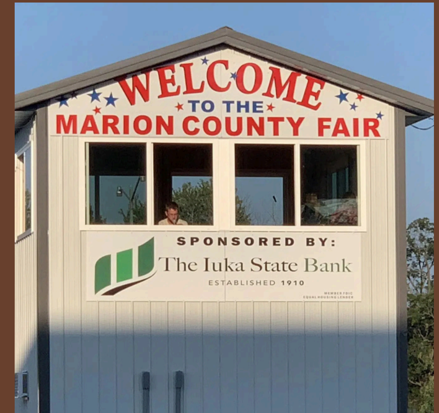
Announcer Stand Example