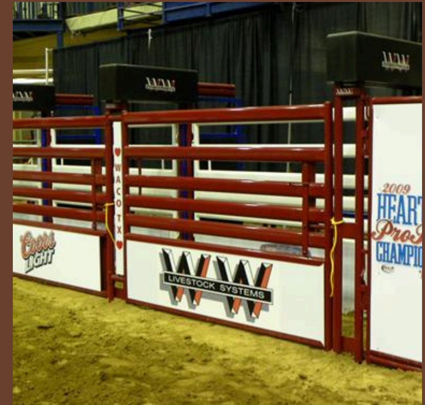
Bucking Chute Example